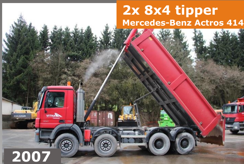
2x 8x4 tipper Mercedes-Benz Actros 4141