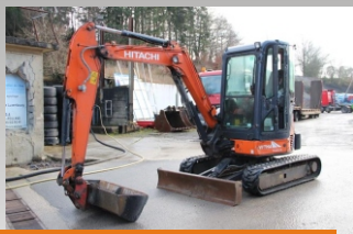
FURUKAWA - VOLVO - HITACHI