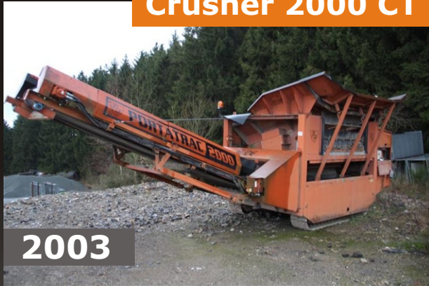
Crusher 2000 CT