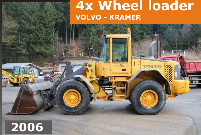
4x Wheel loader VOLVO - KRAMER